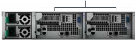
Dual controller modules